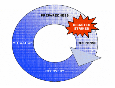
Figure 1. Emergency Management Life Cycle (NRC, 2007)

US National Governor's Association developed an all-hazard or comprehensive disaster management model in the early 1970s. With this approach, disaster management activities divided into four functional classes: mitigation, preparedness, response, and recovery (See in Figure 1.). While mitigation and preparedness are pre-emergency activities, response and recovery are considered during and post-emergency activities, respectively. Mitigation deals with disasters to prevent or reduce losses. Preparedness is planning and enhancing response activities for managing disasters. Response begins immediately following an event and examples include mass evacuation, providing medical care, search and rescue, firefighting, containing the hazard, and protecting property and the environment. Recovery continues after the event to restore lifelines (Waugh, 2000).